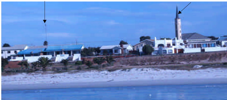
Church Spire 156° (4.7.28)