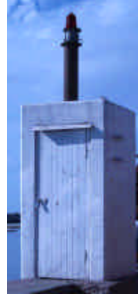
Q.R. Light on white square Concrete tower (4.7.25)